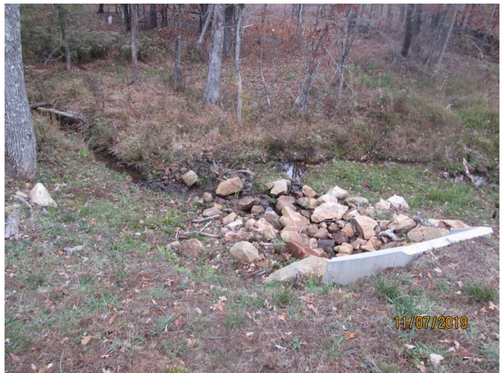
Photo Taken 11/7/2019

View of the stabilized pipe outfall from a stormwater detention basin just upstream of the stream origin.