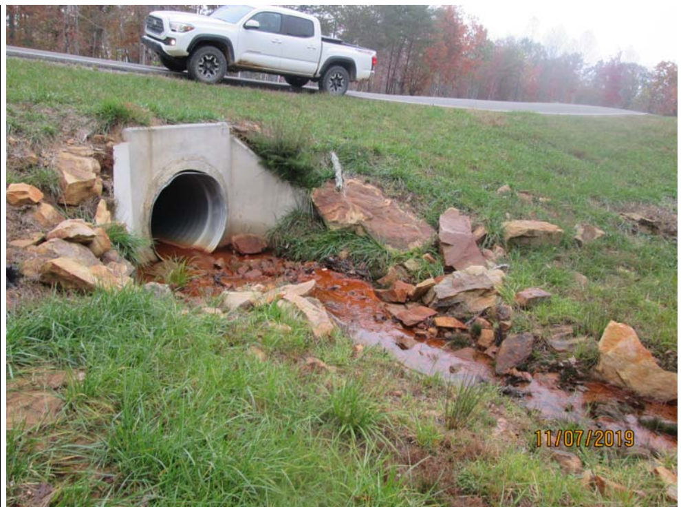
Photo Taken 11/7/2019

View of the stabilized upstream end of the road crossing.