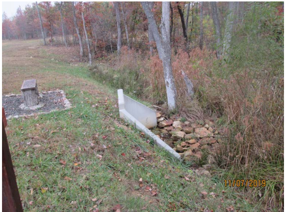
Photo Taken 11/7/2019

View of the stabilized upstream end of the road crossing.