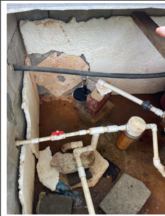
Upper right corner of photograph