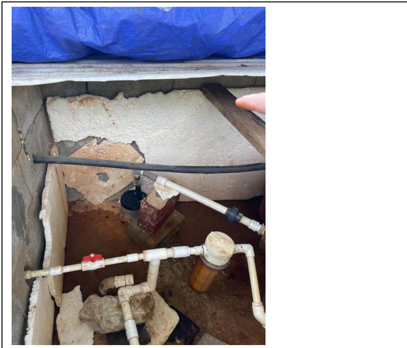
Upper right corner of photograph