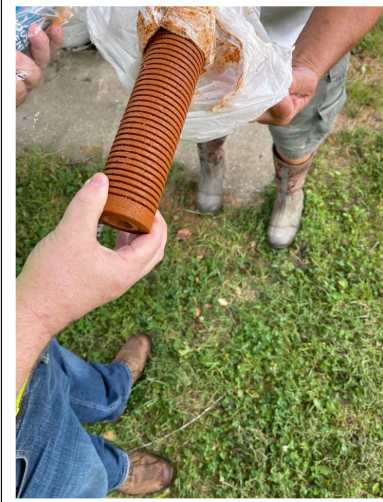
Upper right corner of photograph