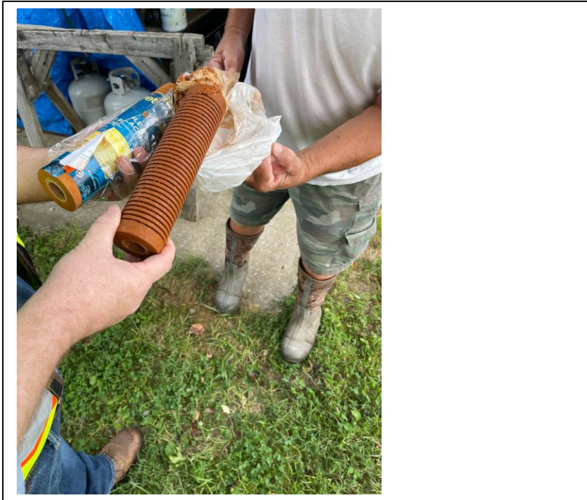
Upper right corner of photograph