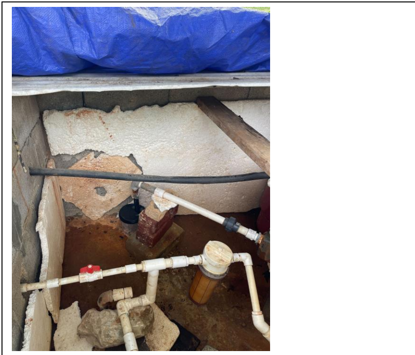
Upper right corner of photograph