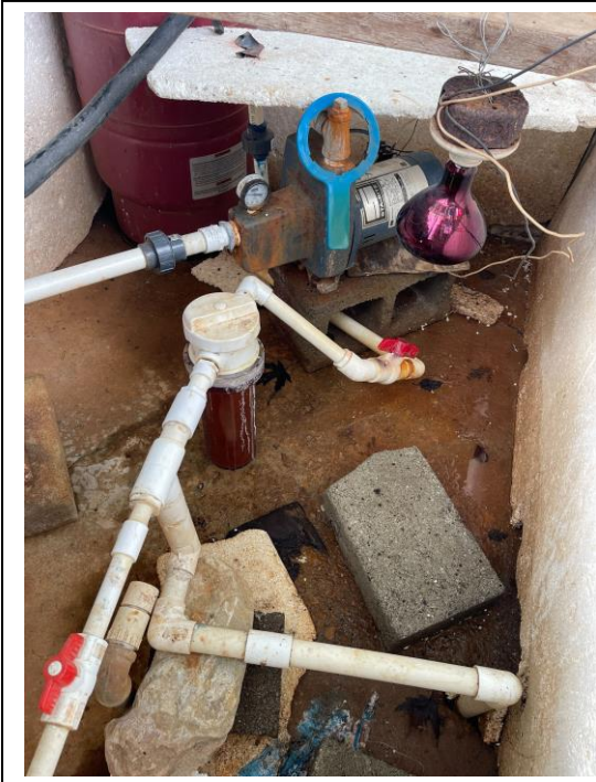
Upper right corner of photograph