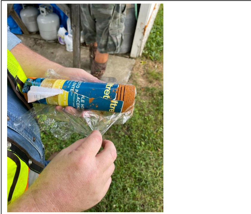
Upper right corner of photograph