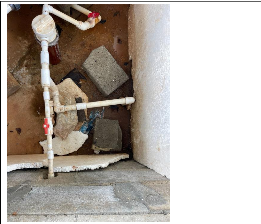
Upper right corner of photograph