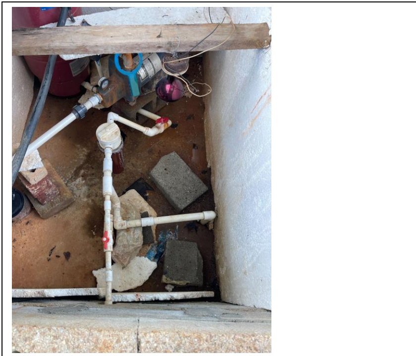
Upper right corner of photograph