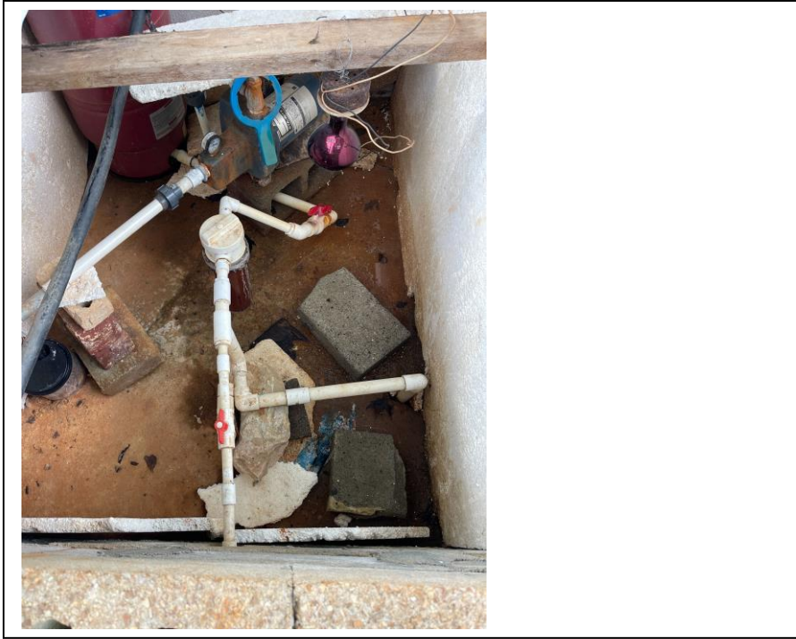
Upper right corner of photograph