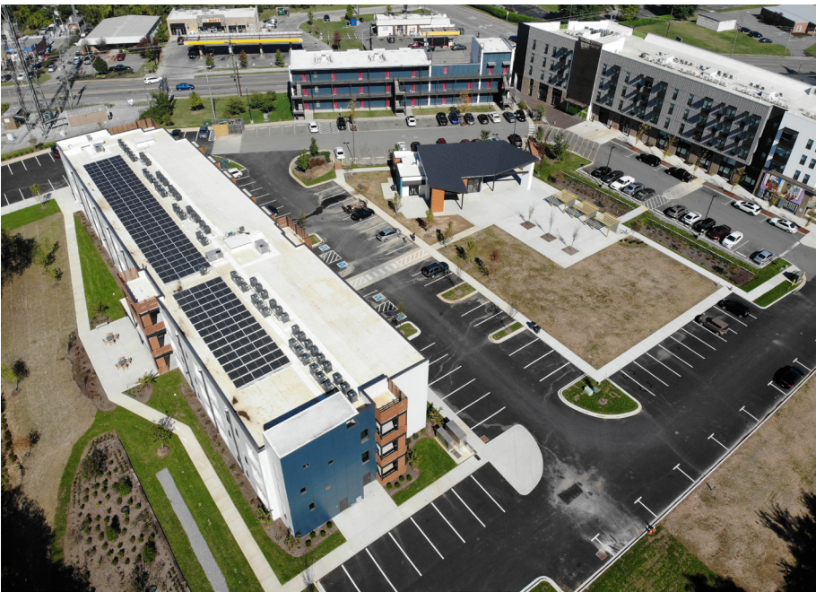
Aerial view of site from southwest