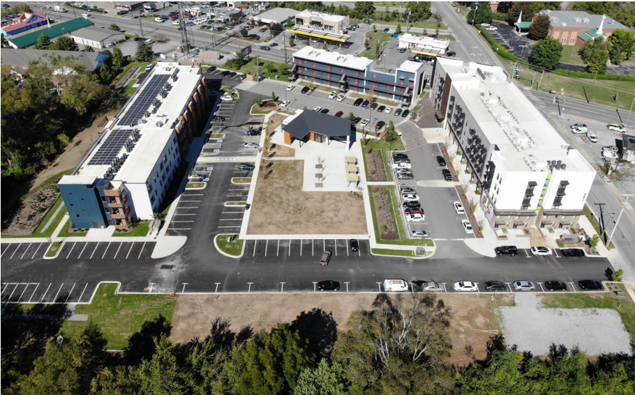
Aerial view of site from south