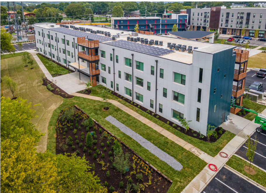
Aerial view of bioretention and completed grading