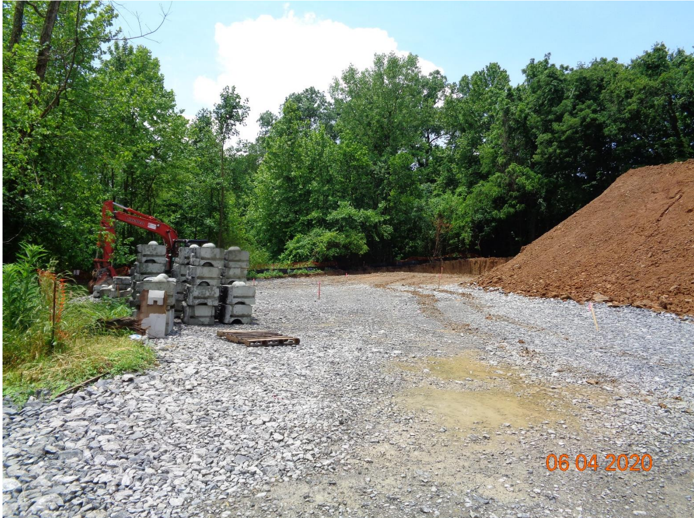
Photo 8: View of south end of site. Wetlands buffer is in this area.

Site: Aloft Hotels Permit ID: TNR240679 Location: 608 McGavock Pike Nashville, TN Date: 6/4/2020 Inspector: J. Leffew