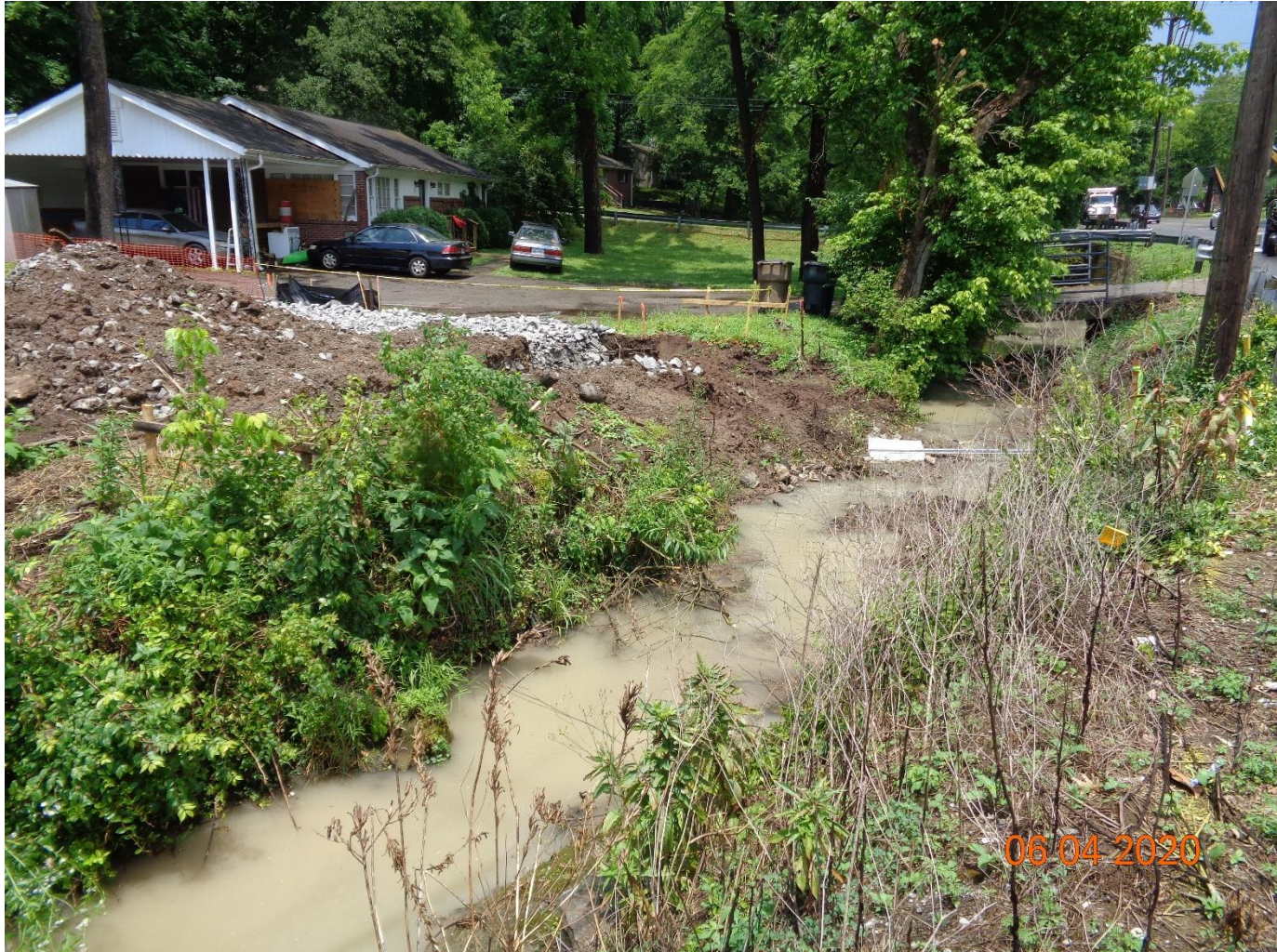
Photo 6: North end of site. Note that the feature is not protected from the disturbed area by EPSCs

Site: Aloft Hotels Permit ID: TNR240679 Location: 608 McGavock Pike Nashville, TN Date: 6/4/2020 Inspector: J. Leffew