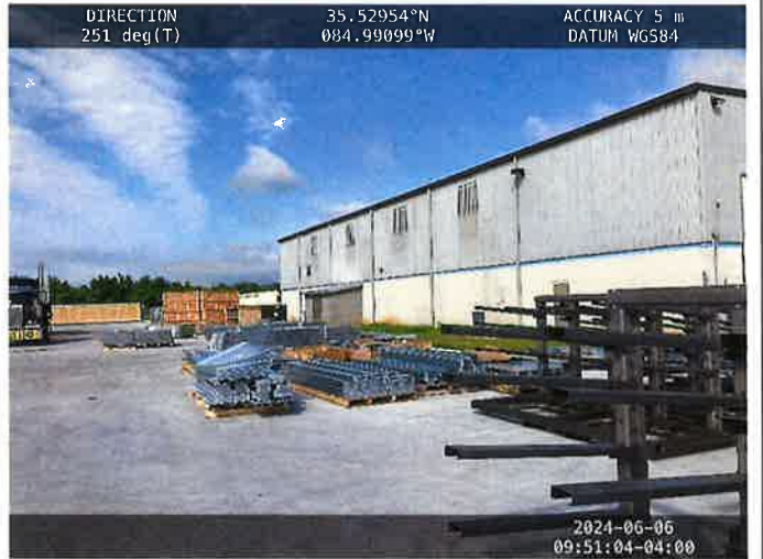
Photo 10: North lot storage area; wood, metal, cardboard cycled through every 3-4 days.