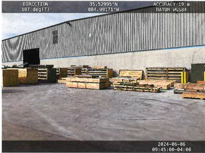
Photo 9: North lot storage area; wood, metal, cardboard cycled through every 3-4 days.