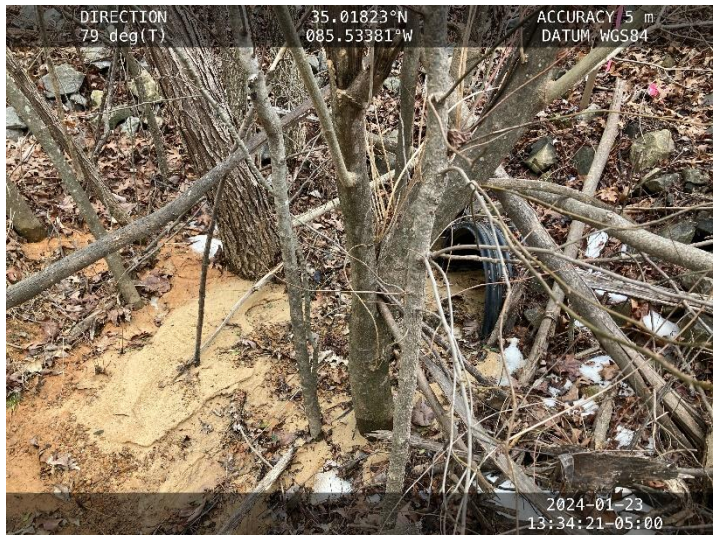
Photo 4: Evidence of sediment transport from culvert under site entrance in Photo 2 - connects directly to wet weather conveyance in sediment accumulation in Photo 3.