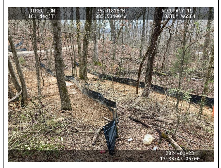
Photo 3: Off site sediment in wet weather conveyance just below Photo 2. Flows to reservoir.