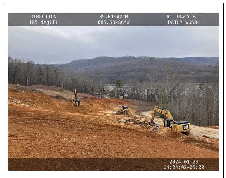
Photo 9: Facing down access road (below basin) towards recently excavated depression to temporarily help with sediment control.