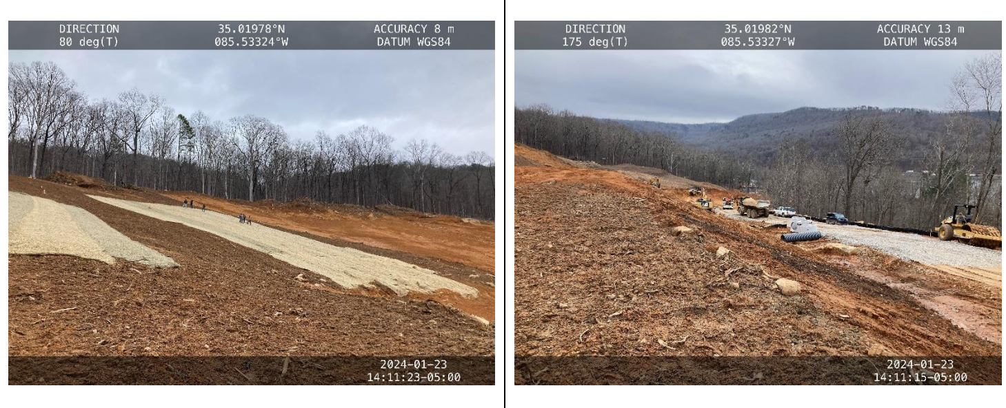
Photo 11: Matting currently being installed along slope above basin.