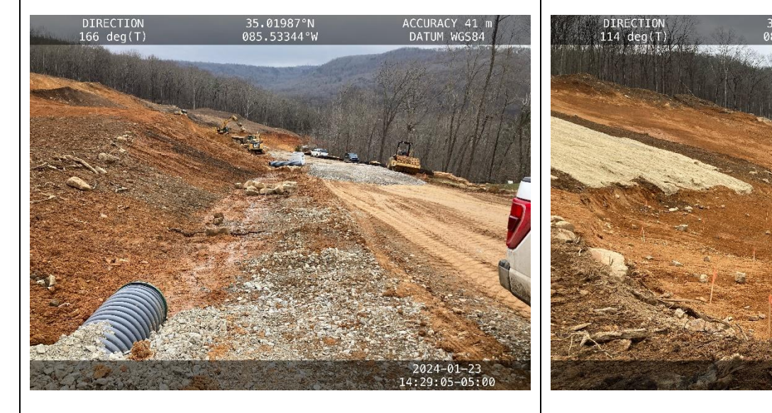
Photo 7: Facing south along access Rd at where check dams are shown on EPSC sheets.