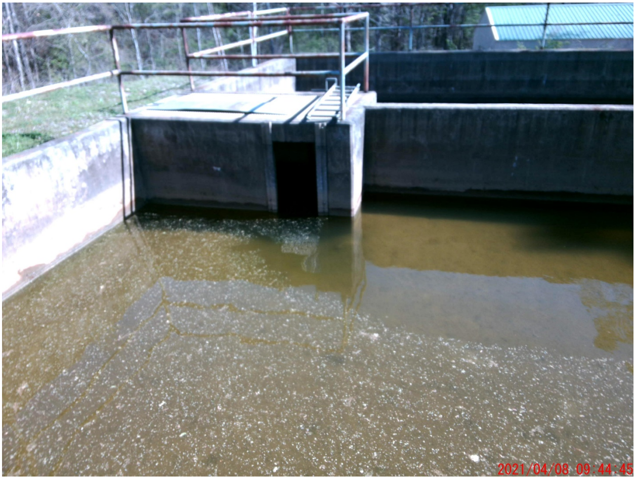
Image 2 - Sedimentation Basin Splitter at Influent