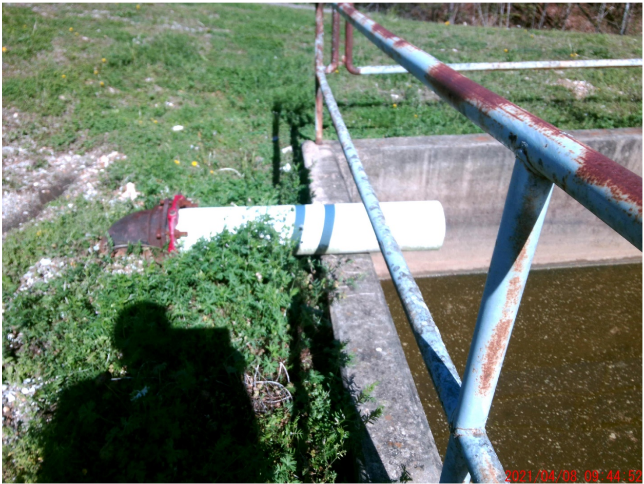
Image 2 - Plant Bypass/Overflow Pipe