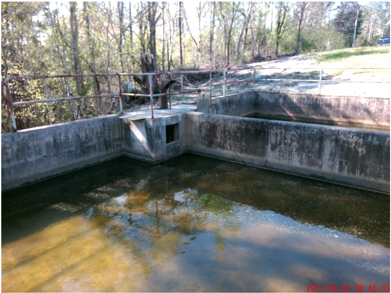
Image 3 - Discharge Gate in Lower Basin