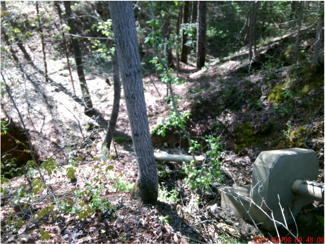
Image 5 - Overland Discharge Area