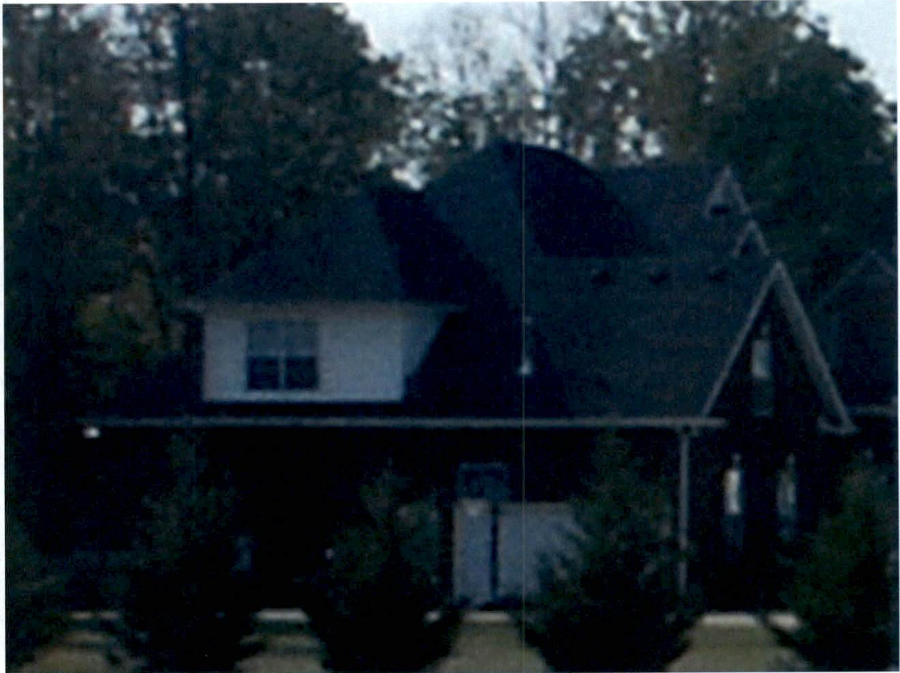
Home at Royal Glenn – Consolidated Utility District, Rutherford County, TN