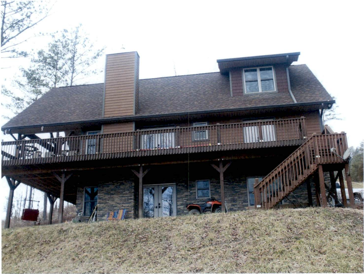
Home at Stonebridge, Jefferson County, TN