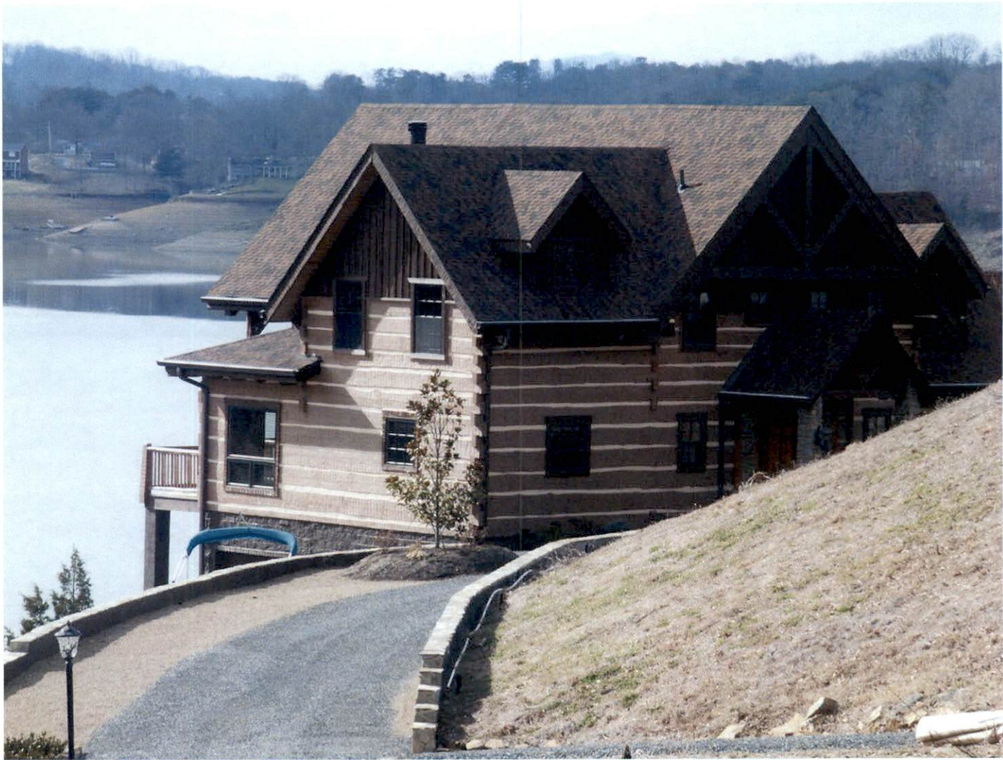
Home at Stonebridge, Jefferson County, TN