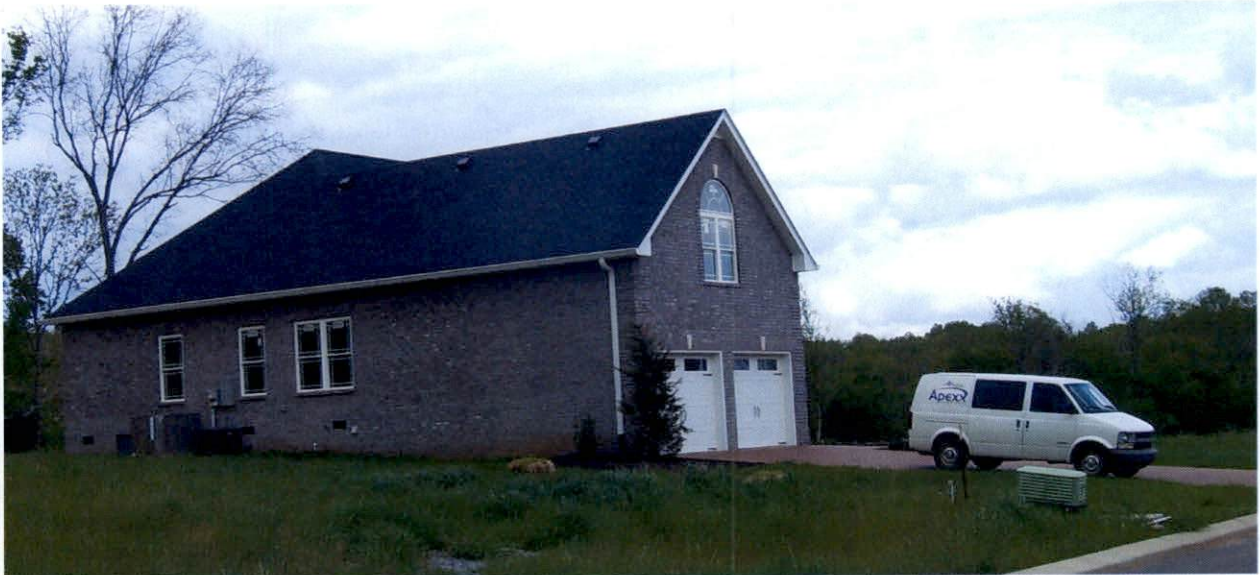
Typical home served by Tennessee Wastewater Systems, Inc. (TWSI) Wilson County, TN