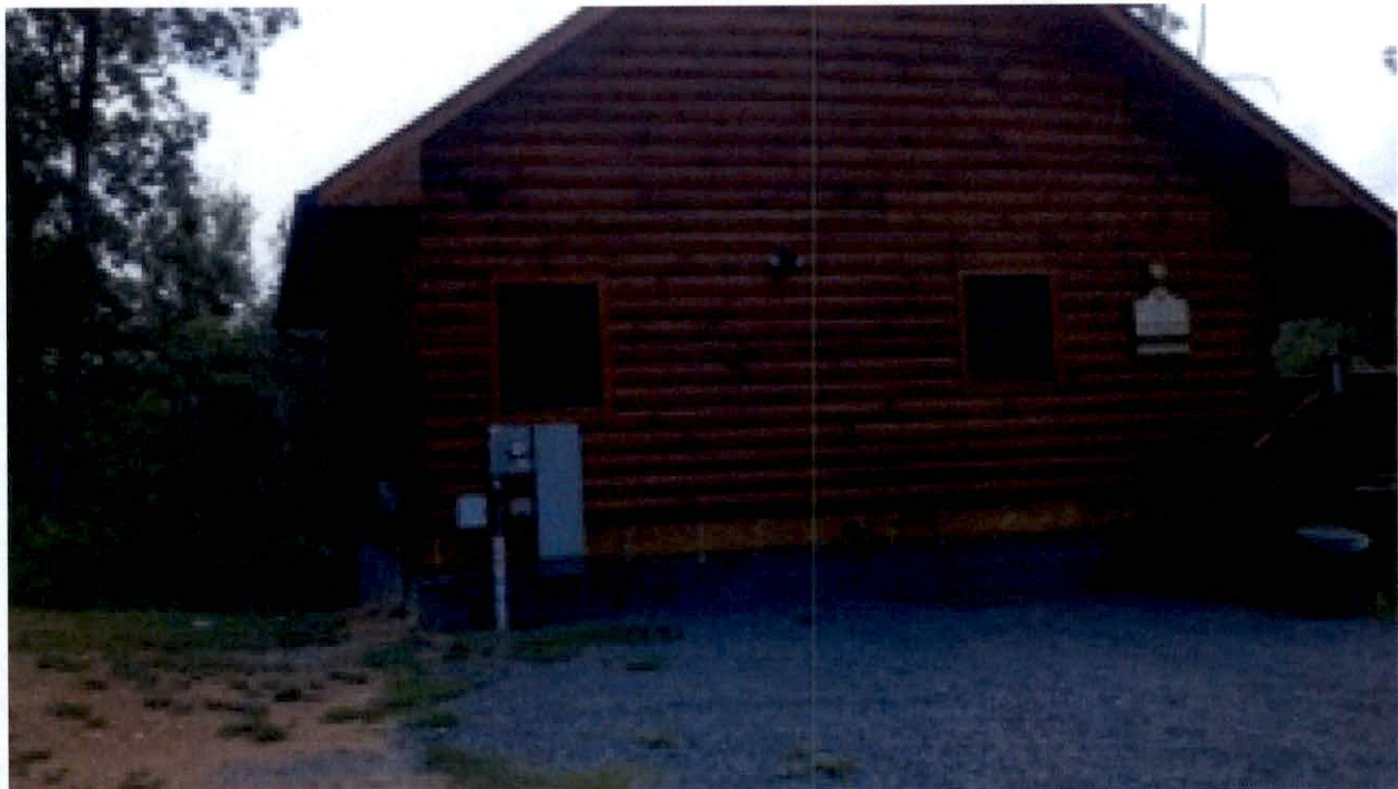
Cabin unit served by Tennessee Wastewater Systems, Inc. (TWSI) Starr Crest 2, Sevier County, TN