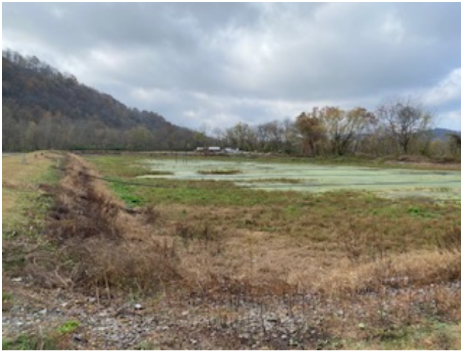
Figure 1: Lagoon #1 - Drained

Recently, the City of Celina began efforts to remove and replace their Headworks unit with a new Mechanical Screen. This project is nearing completion and should be functioning by the end of 2022. During construction, Lagoon #1 was drained for the installation of the headwork effluent piping. While drained it was evident that the sludge build-up in Lagoon #1 was excessive.