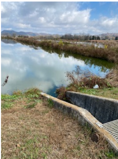
Figure 2: Lagoon #2

The City of Celina will also pursue a project to correct all three (3) lagoons in 2023. The City of Celina was recently granted $1,406,575.00 of ARP funds. A portion of these funds, by City resolution passed in October of 2022, will be allocated to completing a project at the WWTP intended to remediate all three (3) lagoons. The project will include the proper removal and disposal of all deposits collected within the lagoons. Removing these deposits will provide adequate lagoon volumes for proper detention time and treatment. The aeration system will also be rehabilitated to provide proper air distribution throughout the lagoons.