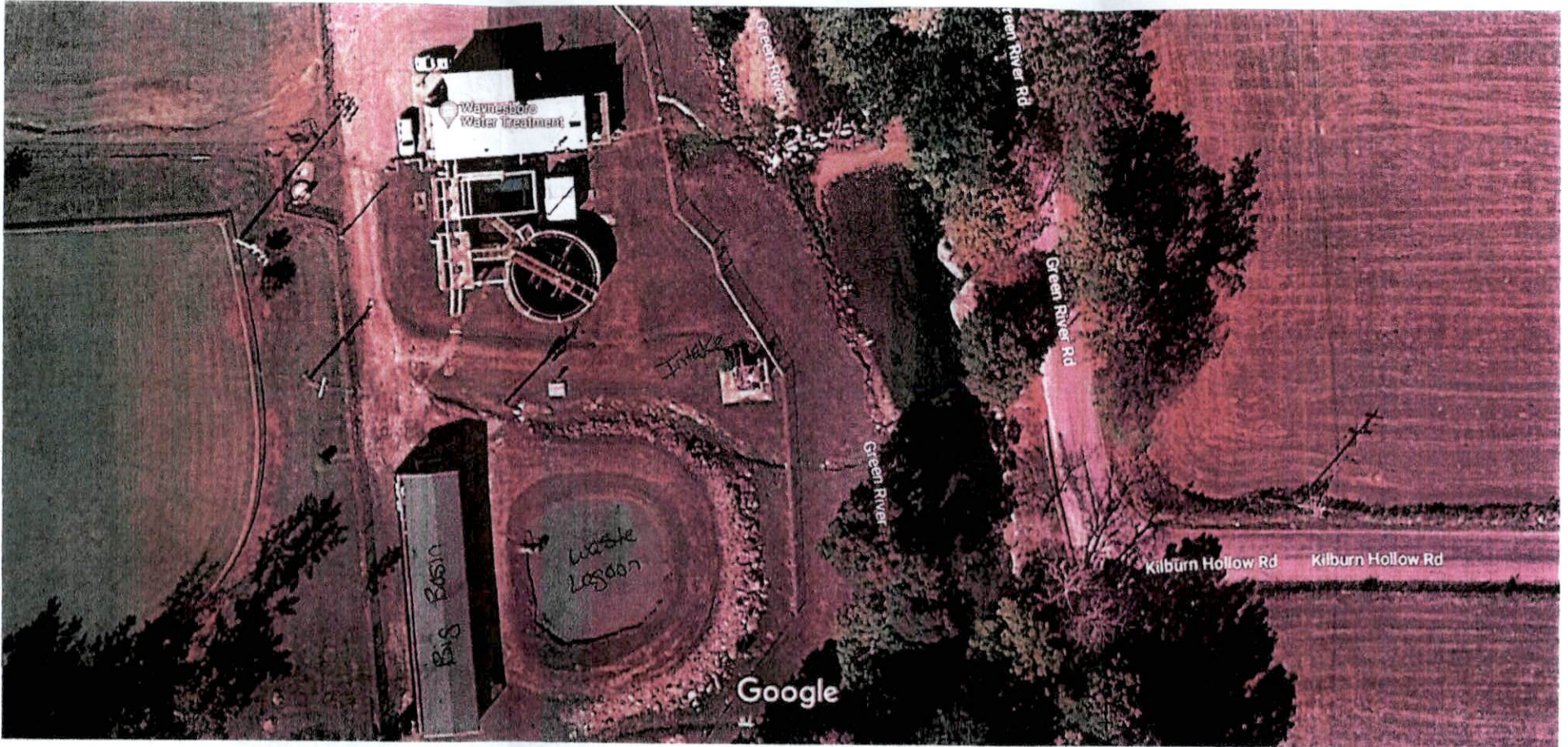
Imagery ©2023 Maxar Technologies, Map data ©2023 20 ft