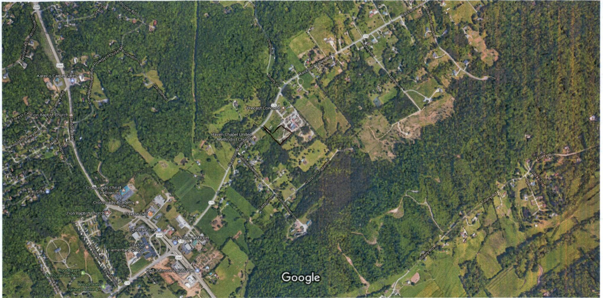
Imagery ©2017 Google, Map data ©2017 Google 500 ft