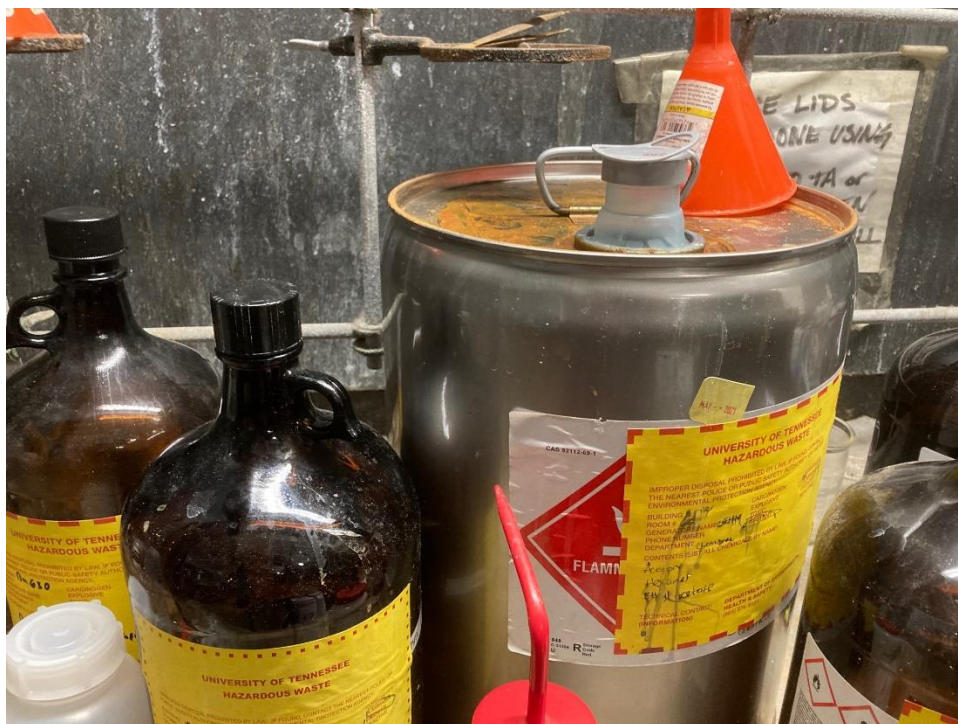
Photo 1, Satellite hazardous waste accumulation containers as observed in the Buehler 630 lab, April 12, 2022, with the 5-liter container closed.