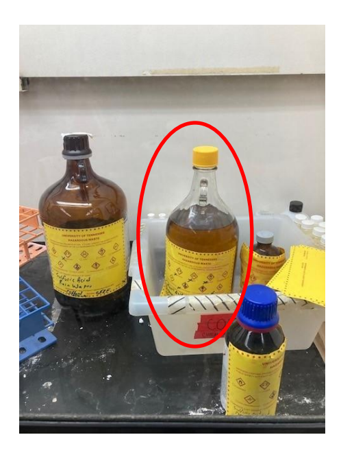
Photo 2: The 4-liter satellite container in the Science and Engineering Research Facility (SERF) Room 702 has new hazardous waste label with hazard indication markings.