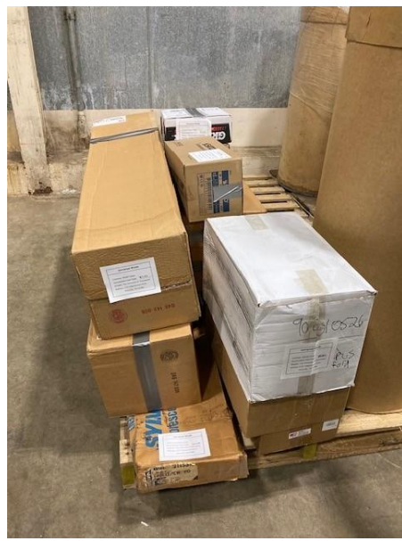
Photos 5-7: All universal waste batteries and lamps at the Fleming Center are closed, labeled, and marked with a storage date.