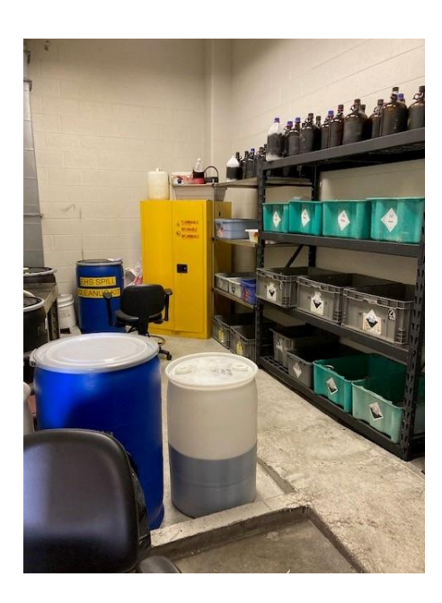
Photos 3 and 4: The facility provided accumulation start dates on all containers in the SERF central accumulation area and performed housekeeping to remove miscellaneous equipment.