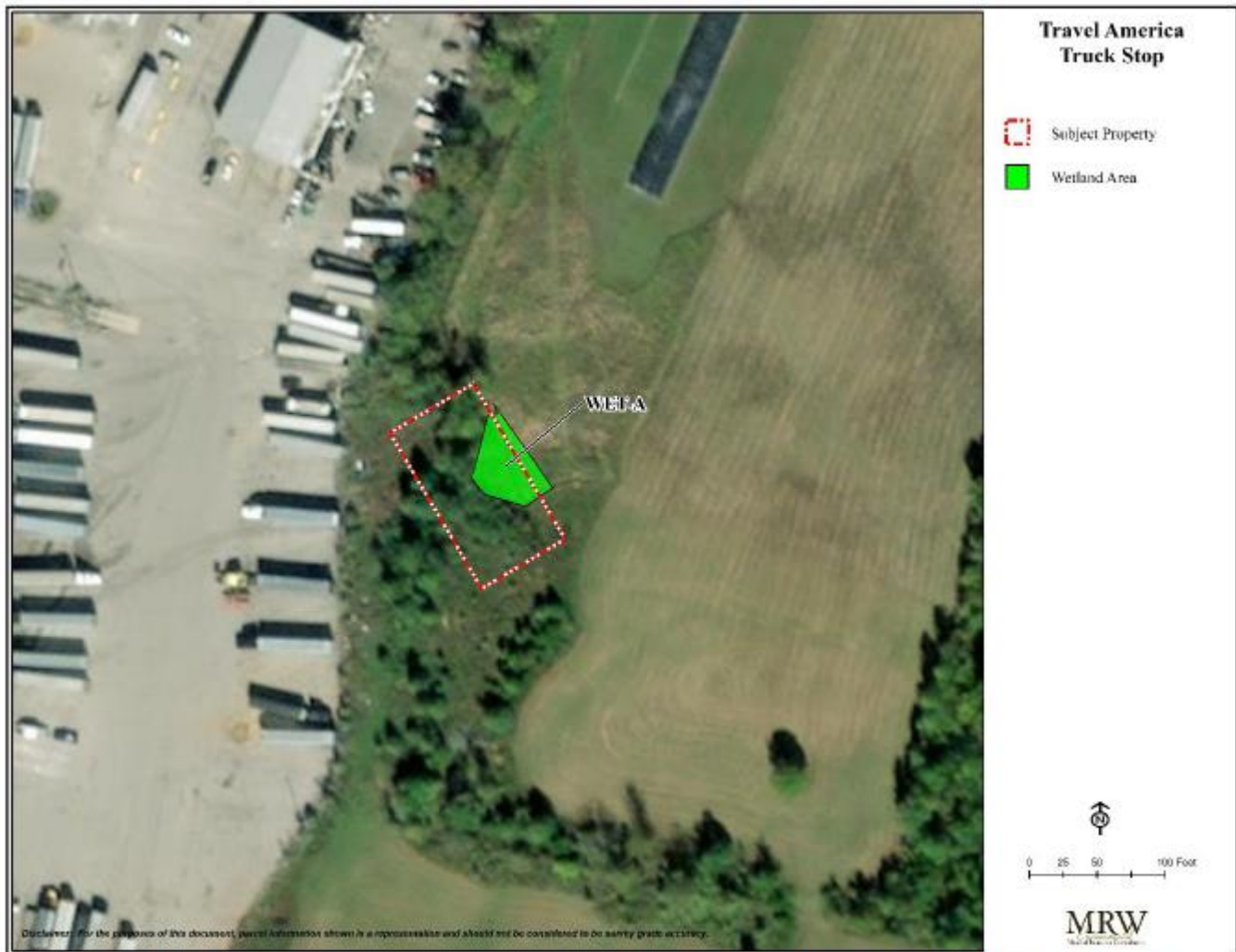
Figure 4. Hydrologic Features (i.e., wetland area) identified within the Subject Property.