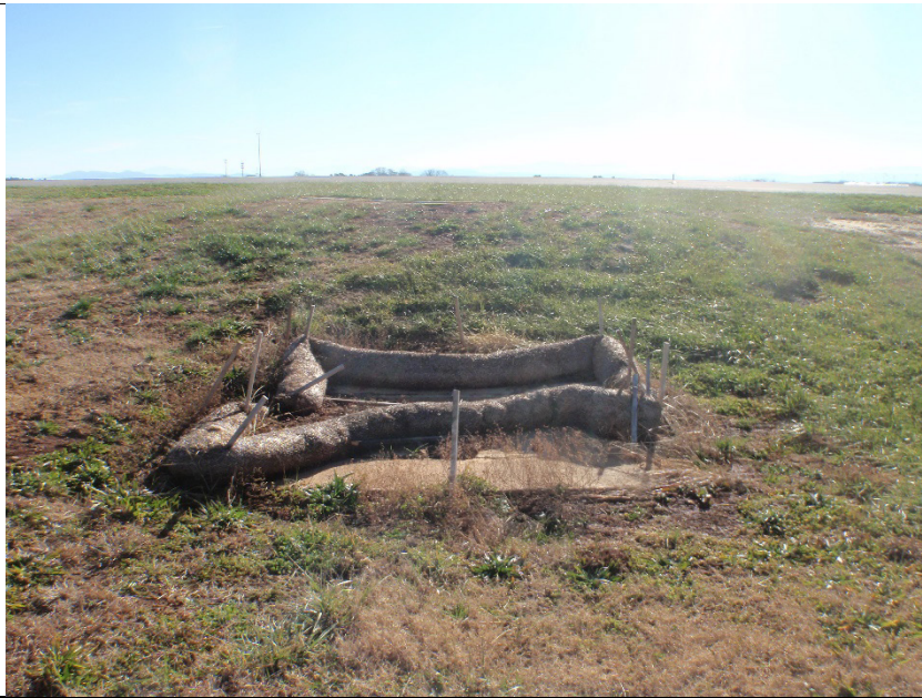
Structure 202 Area is stable.