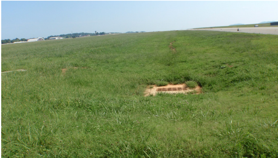
Storm structure 218. Area is stable.