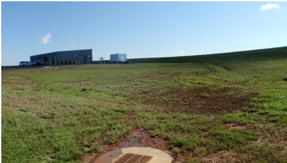
Airfield Lighting Vault. Area is stable.