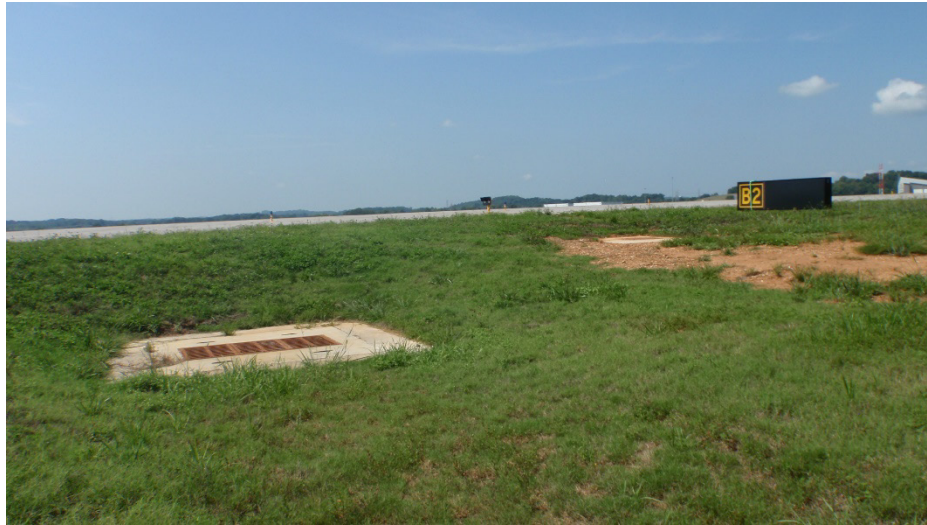
Storm structure 214. Area is stable.