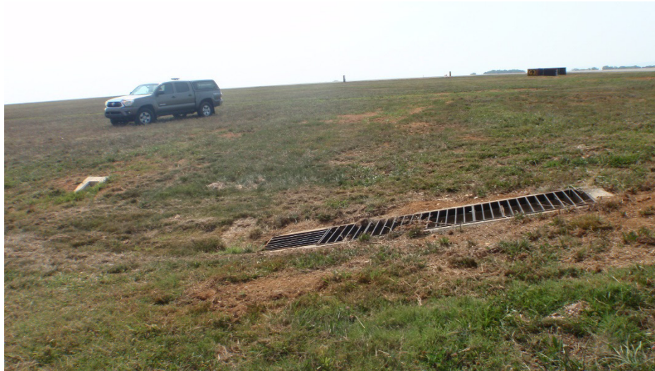
Enhanced Swale Endwall 108 adjacent to Taxiway G3. Area is stable.