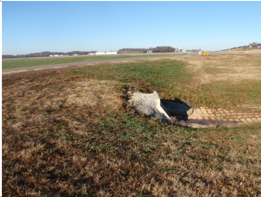
North lateral ditch at the airfield lighting vault. Area is stable.