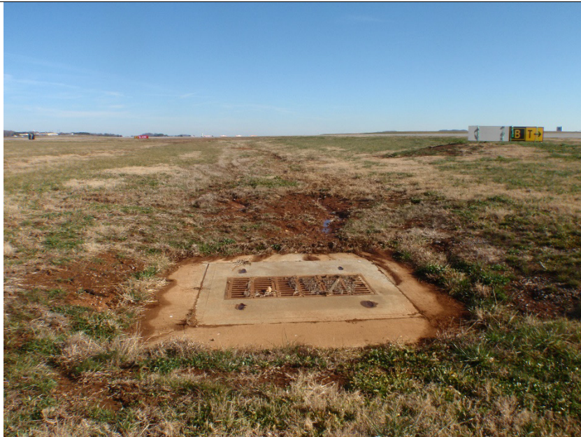
Storm structure 212. Area is stable.