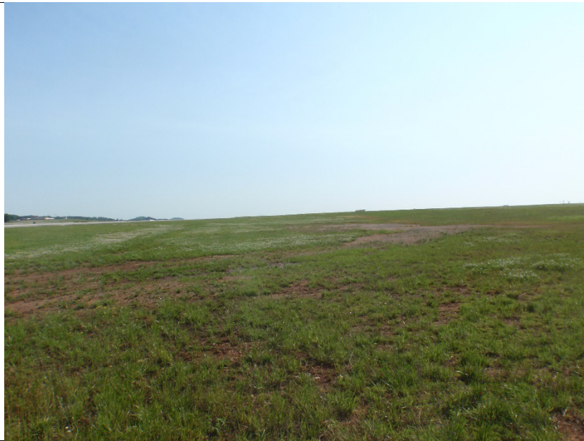
Area of duct bank installation above new vault. Area is stable.