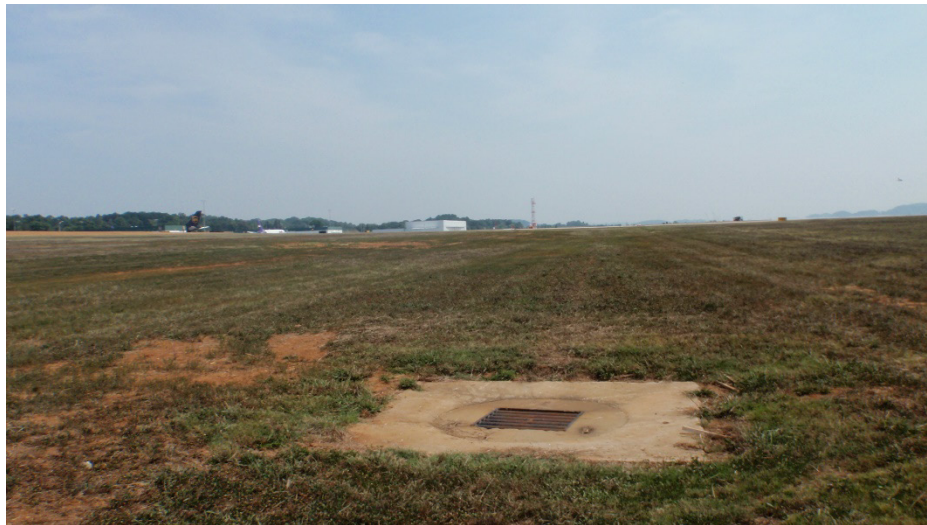
Existing Storm structure #2. Area is stable.