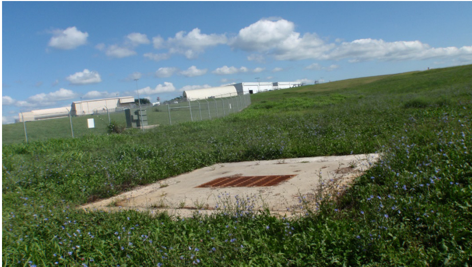
Storm structure 124 Area is stable.