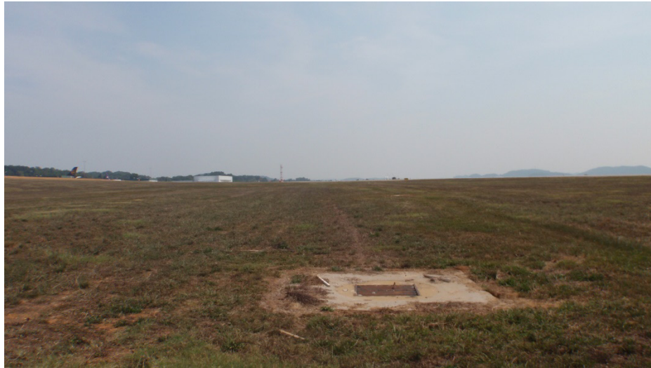
Existing Structure #1. Area is stable.