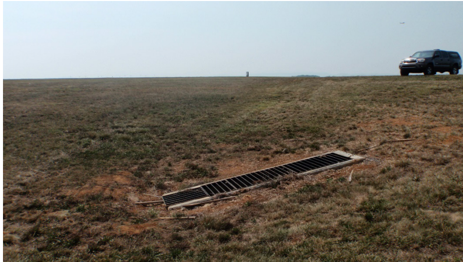
Enhanced Swale Endwall 104 Area is stable.