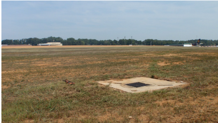
Existing Structure #3. Area is stable.