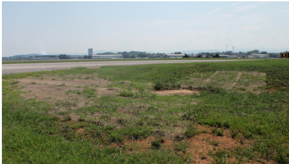
Structure 200. Area is stable.