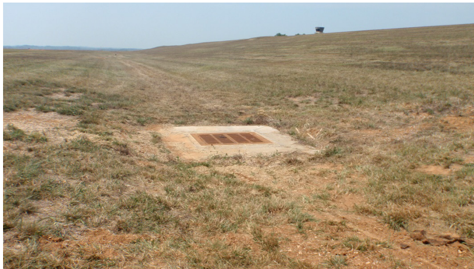
Storm structure 100 adjacent to ELD/FOTS duct bank. Area is stable.