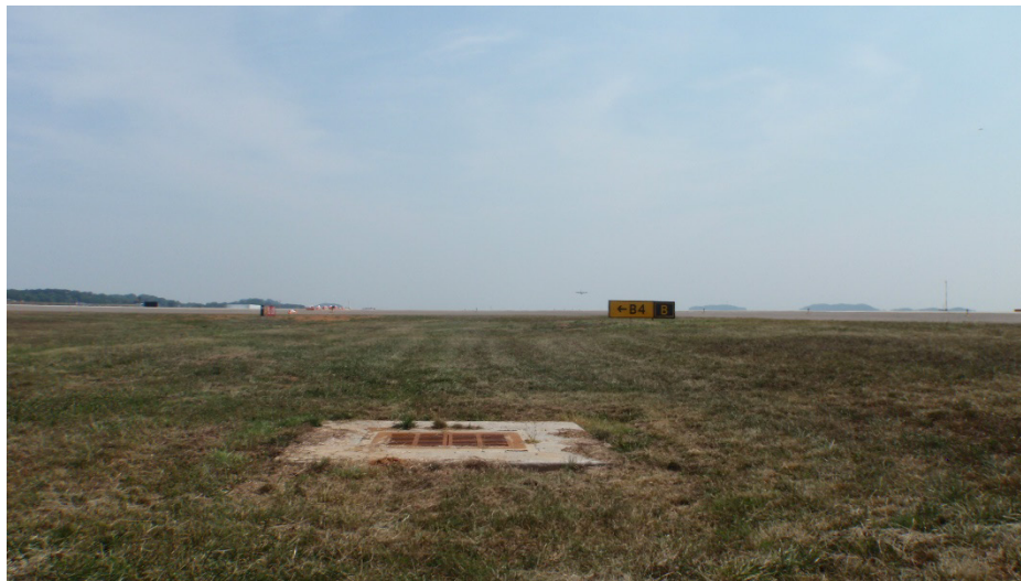
Structure 204 Area is stable.