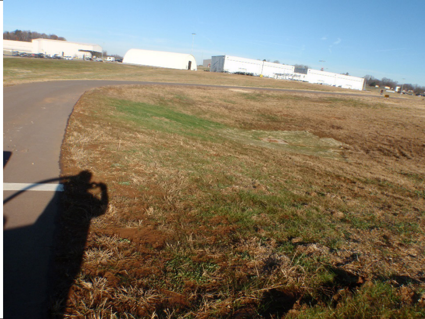
MALSR access road. Area is stable.