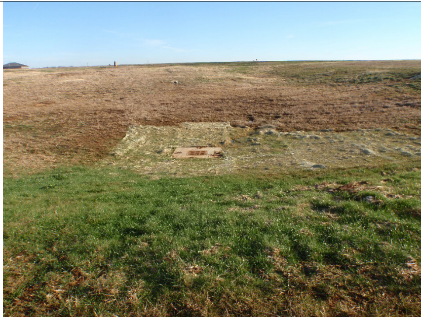
New storm structure adjacent to MALSR access road. Area is stable.