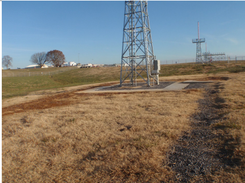
Old Liberty Street Area is stable.