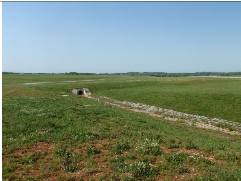
North lateral ditch at the airfield lighting vault. Area is stable.