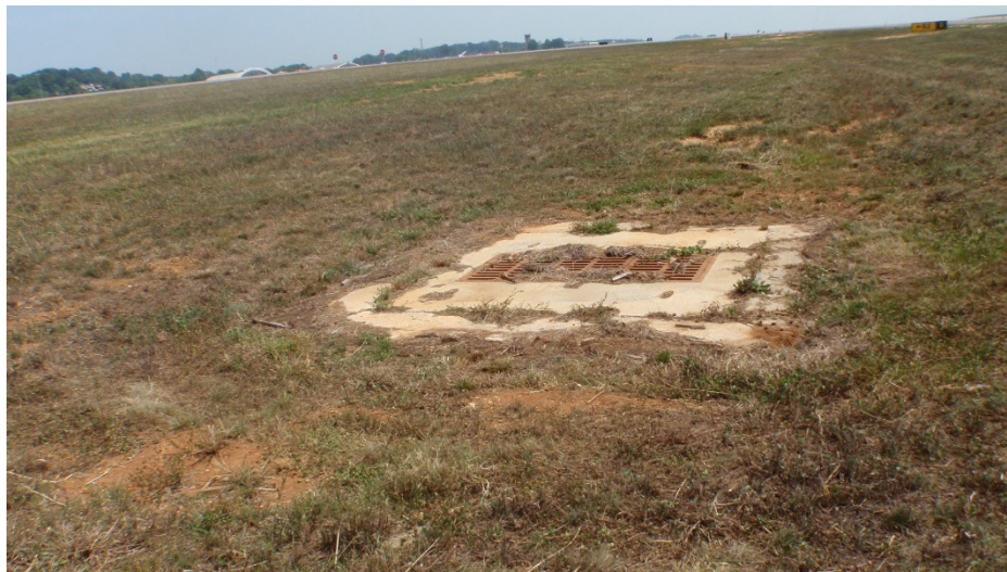
Storm structure 216. Area is stable.