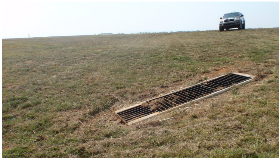
Enhanced Swale Endwall 106 Area is stable.