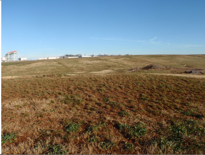
Area of duct bank installation between the hall road and the North lateral ditch. Area is stable.