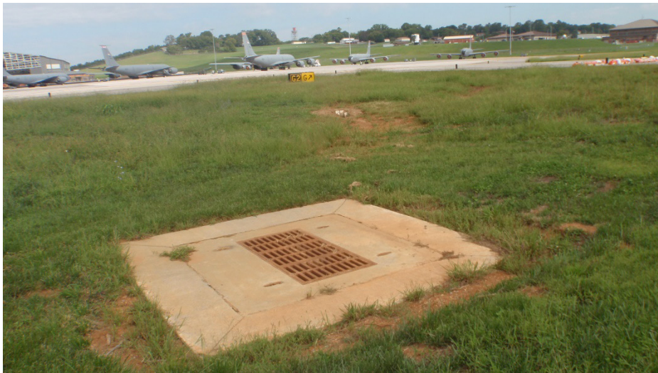
ELD structure 9. Area is stable.