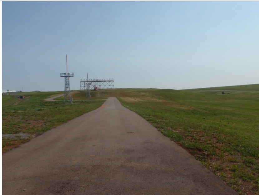
MALSR access road Area is stable.