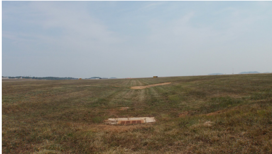
Storm structure 206. Area is stable.