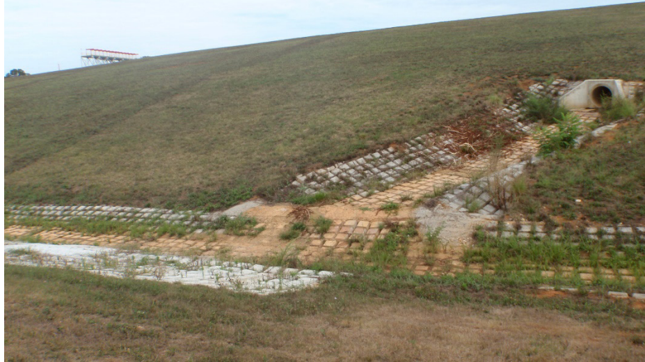
Structure 224. Area is Stable