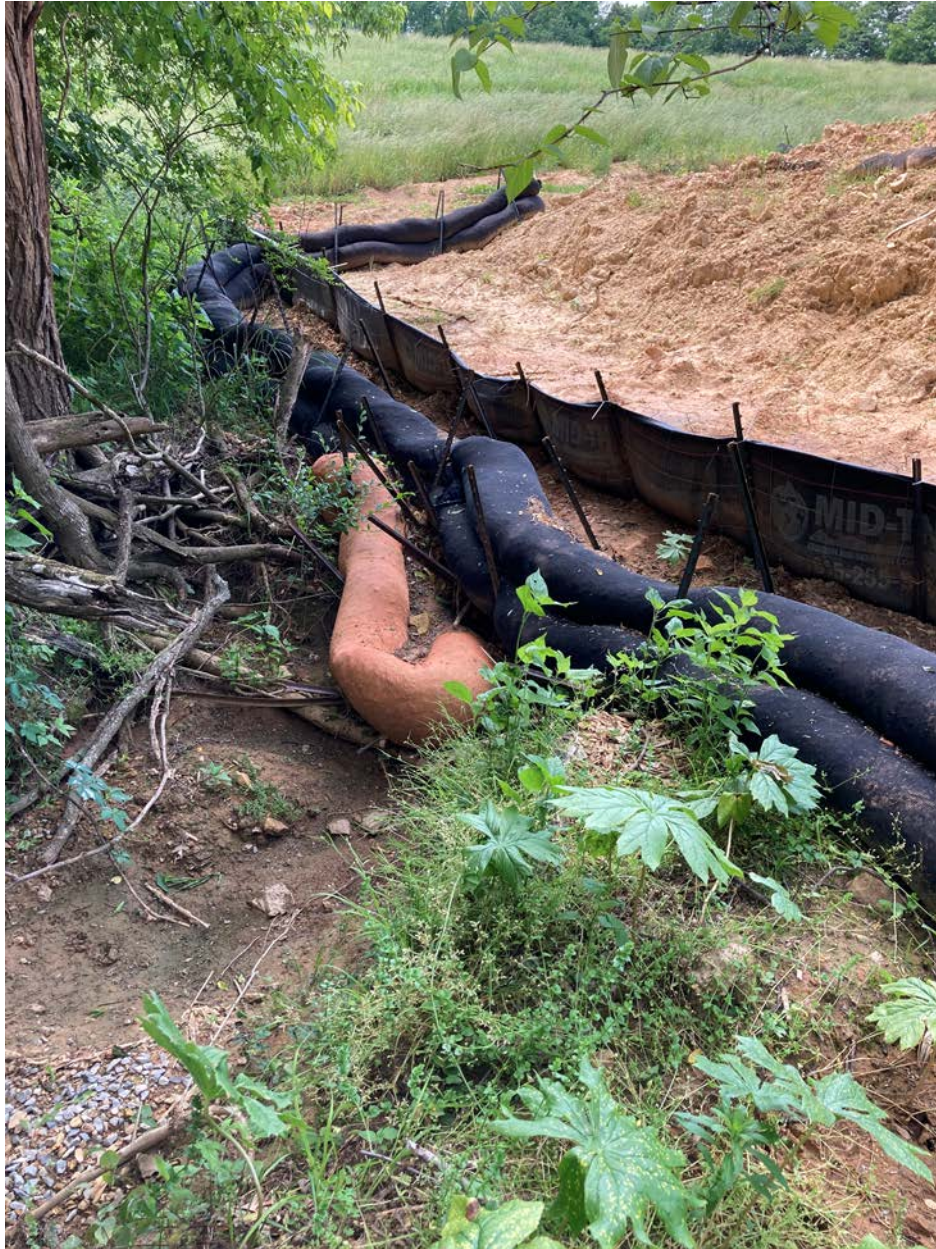
Photo 3. View of sediment entering offsite wet weather conveyance by discharge of untreated stormwater. Photo taken by Division staff on 18-MAY-2022.